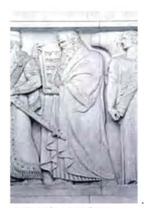
DID YOU KNOW?

As you enter the Supreme Court courtroom, the Two huge oak doors have the Ten Commandments Engraved on each lower portion of each door